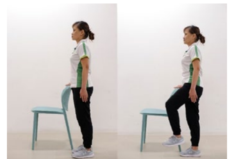
Single leg balance